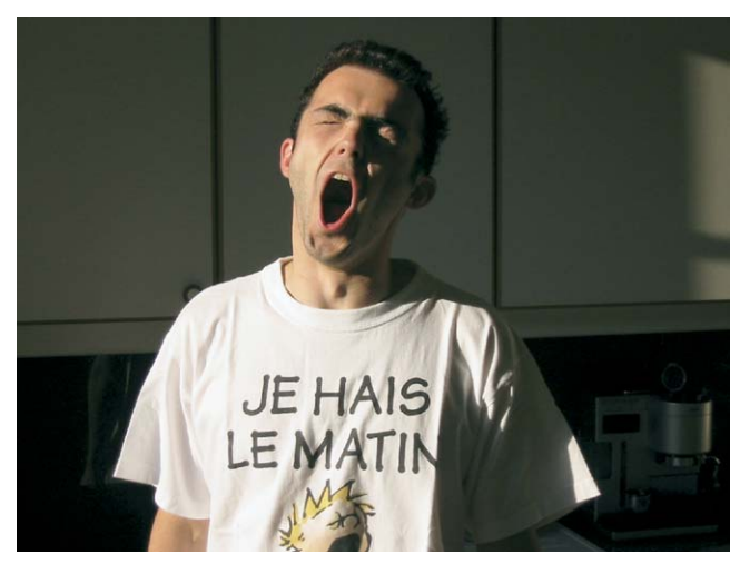
Figure 2. Human yawning. (Courtesy of Olivier Walusinski, whose son is the subject depicted.)

they are born. Yawning can even be detected by 4-dimensional sonography in a fetus<sup>4</sup> (Figure 4). In fact, the lack of fetal yawning may be a key to predicting brain stem dysfunction after birth.<sup>4</sup>