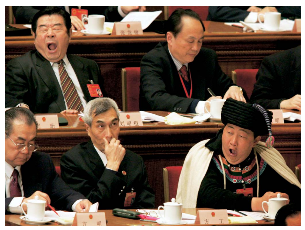
Figure 3. Yawning is contagious, as shown by the responses of the delegates to China's National People's Congress to a series of long-winded reports in Beijing's Great Hall of the People on March 9, 2005 (from Provine,<sup>8</sup> with permission.)