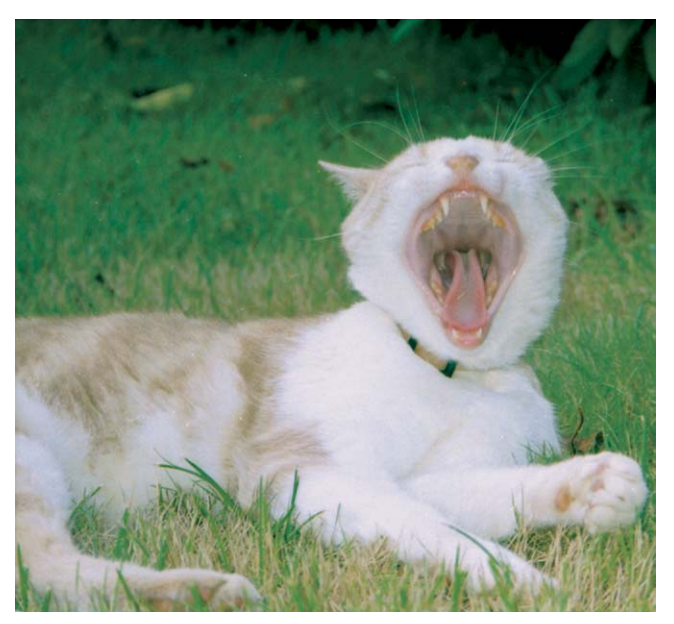
Figure 1. Kitten yawning.

Third, yawning is a familiar and frequent occurrence in neonates soon after